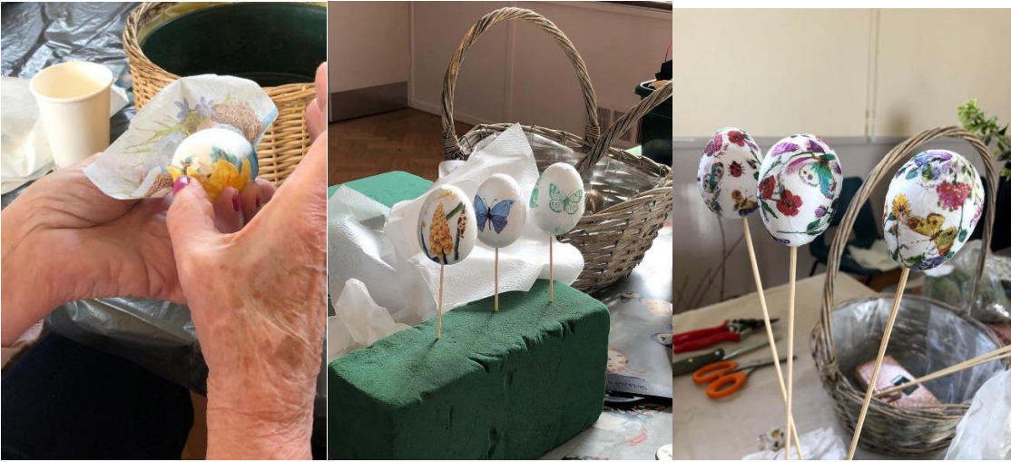
Below: The lovely, finished designs.